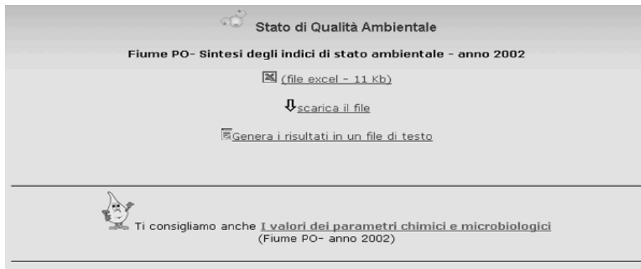
Fig. 5. Annotated search results: a link suggests follow-up queries.

downloaded as a MS Excel® table suitable for data analysis or as a plain text file (“Genera i risultati in un file di testo”). Moreover, the results are shown in a table reporting: the town of the observation points (“Comune”), the values of the environmental state (SACA), the values of the ecological state (SECA), and so forth. 1